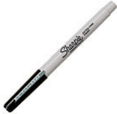
Fine point permanent markers