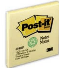
3" x 3" post-its