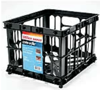
Crate that will hold legal size folders