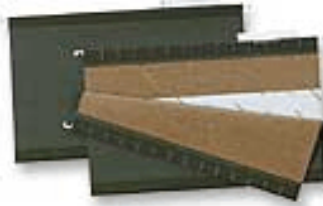
Hanging file folders