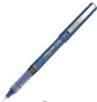
Pens (You'll definitely need a red pen)