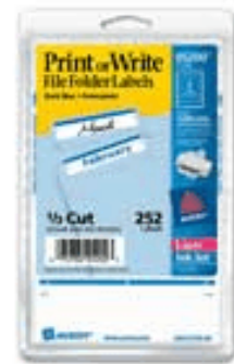
File folder labels