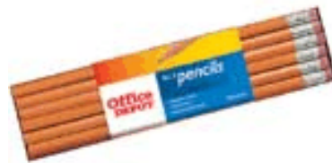
Pencils (mechanical Pencils work great)