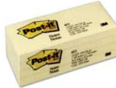
1 1/2 " x 2" post-its